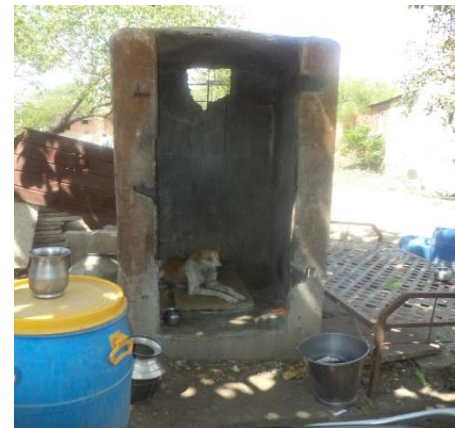
A toilet being used as washing platform

In a couple of FGDs the rural women stated that they were told to construct and use toilet by the doctors they saw in the recent past and no other have ever approached them. This speaks volume about non-existence of proper IEC at the community level. An appropriate IEC through posters, banners, rally etc. followed by sustained interpersonal communication (IPC) and focus group meeting with the women and adolescent girls/youth population and elderly members of the community should be put in place. The Nirmal Doots have not been selected in consultation with the community and they are not functional now. A dedicated team with the SHG leaders, AWW and ASHA may be formed and they may be trained to conduct IPC with all the families. There should be strong advocacy within schools for the students to adapt sanitary behaviour, which is absent. There is also need to organize trigger while kick-starting the programme in each habitation, which is generally absent.