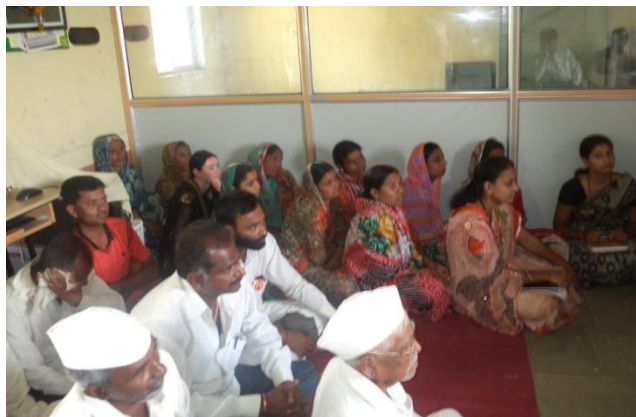
Focus group discussion in progress

4.2 The field study involved an intensive process of consultation by the team with the people engaged in implementation of the NBA at GP level and village level. There was also interaction with different stakeholders like Gram Sevak, Sarpanch and other elected functionaries, SHG representatives, Anganwadi workers, ASHAs, masons, supplier of materials, Nirmal Doots (NDs) within each GP. The community level analysis was done through focus group discussions with the villagers, with representation from various sections of the society including women. Some of the houses having toilets as well as those not having toilets were also visited for in-