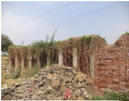
A dilapidated community toilet

Participation is rooted in ownership of the activity and that requires involvement of the community from the planning stage. The approach of the NBA is to make it community led; yet the community is not consulted and explained the reasons for including their areas under the